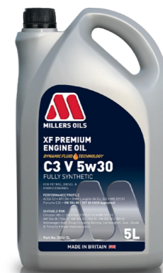
C3 V 5w30 5862

Mid SAPS, for use in petrol, diesel and hybrid engines. A premium OEM approved engine oil formulated using the latest technology for applications requiring C2 or C3 5w30 viscosities. Covering European manufacturers including BMW, Mercedes Benz and GM dexos 2 applications.