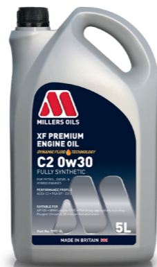
C2 0w30 Code 7997

Mid SAPS, for use in petrol, diesel and hybrid engines. A premium manufacturer acknowledged engine oil formulated using the latest technology for OEM applications requiring a C5 5w20 viscosity, introduced for Ford Eco-Boost petrol engines and Jaguar Land Rover.