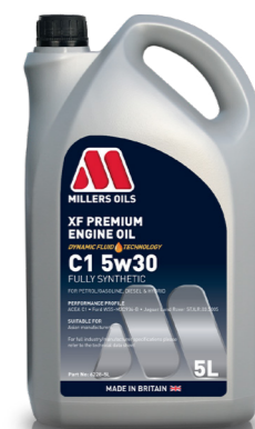
C1 5w30 Code 6228

Mid SAPS, for use in petrol, diesel and hybrid engines. A premium VW 504 00 / 507 00 OEM approved engine oil formulated using the latest technology for applications requiring a C3 0w30 viscosity, designed for Volkswagen Audi Group (VAG) including Lamborghini, Seat, Skoda and Porsche.