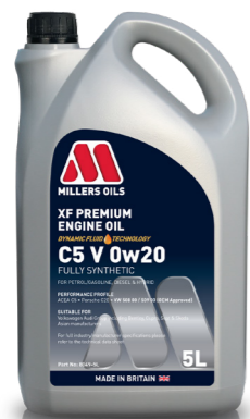
C5 V 0w20 Code 8049

Low SAPS, for use in petrol, diesel and hybrid engines. A premium manufacturer acknowledged engine oil formulated using the latest technology for OEM applications requiring a C1 5w30 viscosity, predominantly for Land Rover/Range Rover vehicles fitted with Diesel Particulate Filters (DPF).