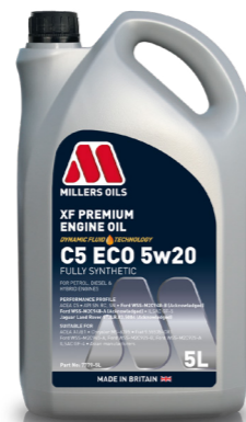
C5 ECO 5w20 Code 7779

Mid SAPS, for use in petrol, diesel and hybrid engines. A premium OEM approved engine oil* formulated using the latest technology for applications requiring a C5 0w20 viscosity designed for Volkswagen Audi Group (VAG) including Bentley, Seat, Skoda and Porsche.