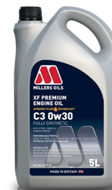
C3 0w30 Code 7998

Mid SAPS, for use in petrol, diesel and hybrid engines. A premium manufacturer acknowledged engine oil formulated using the latest technology for OEM applications requiring a C2 0w30 viscosity, predominantly for Ford and Jaguar Land Rover.