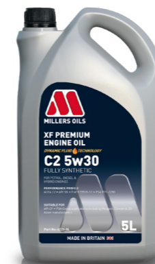
C2 5w30 Code 6229

Mid SAPS, for use in petrol, diesel and hybrid engines. A premium engine oil formulated using the latest technology for OEM applications requiring a C2 0w30 viscosity, predominantly for PSA group applications including Peugeot, Citroen and DS.