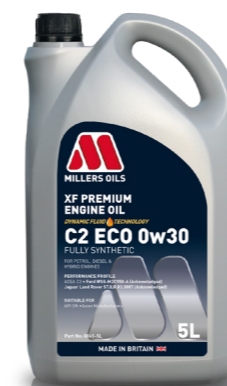
C2 ECO 0w30 Code 8045

Mid SAPS, for use in petrol, diesel and hybrid engines. A premium engine oil formulated predominantly for the PSA group including Peugeot, Citroen & DS and other Stellantis group manufacturers including Opel and Vauxhall.