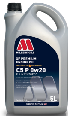
C5 P 0w20 8515

Mid SAPS, for use in petrol, diesel and hybrid engines. A premium OEM approved engine oil* formulated using the latest technology for applications requiring a C5 0w20 viscosity. Designed predominantly for BMW, Ford, Jaguar Land Rover, Opel/Vauxhall, Volvo and Asian manufacturers.