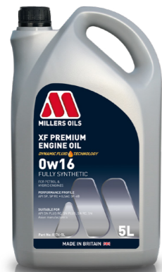
0w16 Code 8174

For use in petrol and hybrid engines. A premium gasoline engine oil formulated using the latest technology for OEM applications requiring a 0w16 viscosity, which provides protection against low speed pre-ignition (LSPI) and timing chain wear. Ideally suited for Honda, Lexus, Nissan, Suzuki, Toyota and other Asian manufacturers.