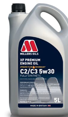
C2/C3 5w30 Code 6230

Mid SAPS, for use in petrol, diesel and hybrid engines. A premium engine oil formulated using the latest technology for OEM applications requiring a C2 5w30 viscosity, predominantly for PSA group applications including Peugeot, Citroen and DS.