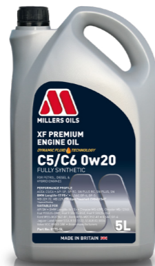
C5/C6 0w20 Code 8175

For use in petrol and hybrid engines. A premium gasoline engine oil formulated using the latest technology for OEM applications requiring a 0w16 viscosity, which provides protection against low speed pre-ignition (LSPI) and timing chain wear. Ideally suited for Honda, Lexus, Nissan, Suzuki, Toyota and other Asian manufacturers.