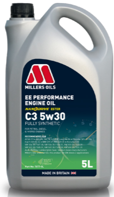
C3 5w30 Code 7877

A performance engine oil featuring NANODRIVE low friction technology for vehicles requiring an A5/B5 or A1/B1 0w30 specification, predominantly for Volvo and a wide range of European and Asian manufacturers.