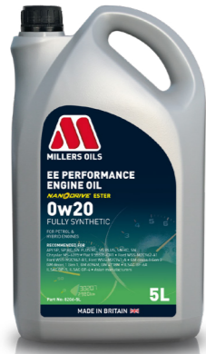
0w20 Code 8206

Fully synthetic, for use in petrol and hybrid engines.