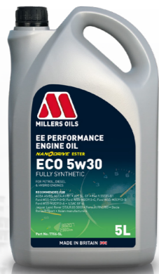
ECO 5w30 Code 7706

A performance engine oil featuring NANODRIVE low friction technology for vehicles requiring an A3/B4 or A3/B3 10w50 specification, predominantly for European and Asian extreme high performance vehicles.