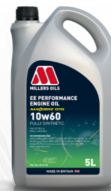
10w60 Code 8210

A performance engine oil featuring NANODRIVE low friction technology for vehicles requiring an A3/B4 or A3/B3 5w40 specification, predominantly for European and Asian high performance vehicles including AMG, Aston Martin, BMW, Ferrari, GM (Opel, Vauxhall, Saab) Lamborghini, Maserati, Mercedes Benz, Nissan Sport, Porsche, Renault Sport.