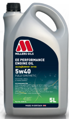
5w40 Code 8208

A performance engine oil featuring NANODRIVE low friction technology for vehicles requiring a C3 5w40 specification. Targeting 'Pumpe Düse' PD Volkswagen Audi Group (VAG) engines including Lamborghini, Seat, Skoda and Porsche. Other coverage includes GM and Mercedes Benz.