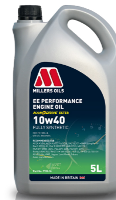
10w40 Code 7708

A performance engine oil featuring NANODRIVE low friction technology for vehicles requiring an A3/B4 or A3/B3 5w50 specification. Recommended for Mercedes Benz AMG powered vehicles, Porsches, Caterhams and Fords including the Mustang.