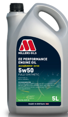
5w50 Code 8209

A performance engine oil featuring NANODRIVE low friction technology for vehicles requiring a C3 5w30 specification. Designed for Volkswagen Audi Group (VAG) including Bentley, Lamborghini, Seat, Skoda and Porsche. Other coverage includes BMW and Mercedes Benz.