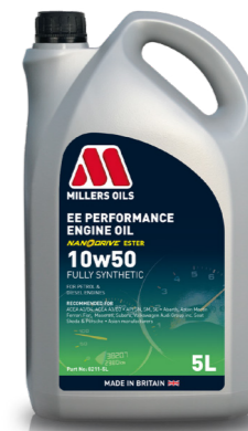
10w50 Code 8211

A performance engine oil featuring NANODRIVE low friction technology for vehicles requiring an A3/B4 or A3/B3 10w40 specification, covering a wide range of older vehicles benefiting from fully synthetic technology.