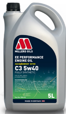
C3 5w40 Code 7806

A performance engine oil featuring NANODRIVE low friction technology for vehicles requiring an A5/B5 or A1/B1 5w30 specification, predominantly for high powered Ford, Jaguar Land Rover and Asian manufacturers.