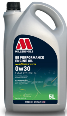
0w30 Code 8207

A performance engine oil featuring NANODRIVE low friction technology for vehicles requiring a 0w20 viscosity, covering a wide range of European and Asian manufacturers.